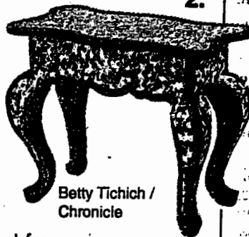
Betty Tichich / Chronicle